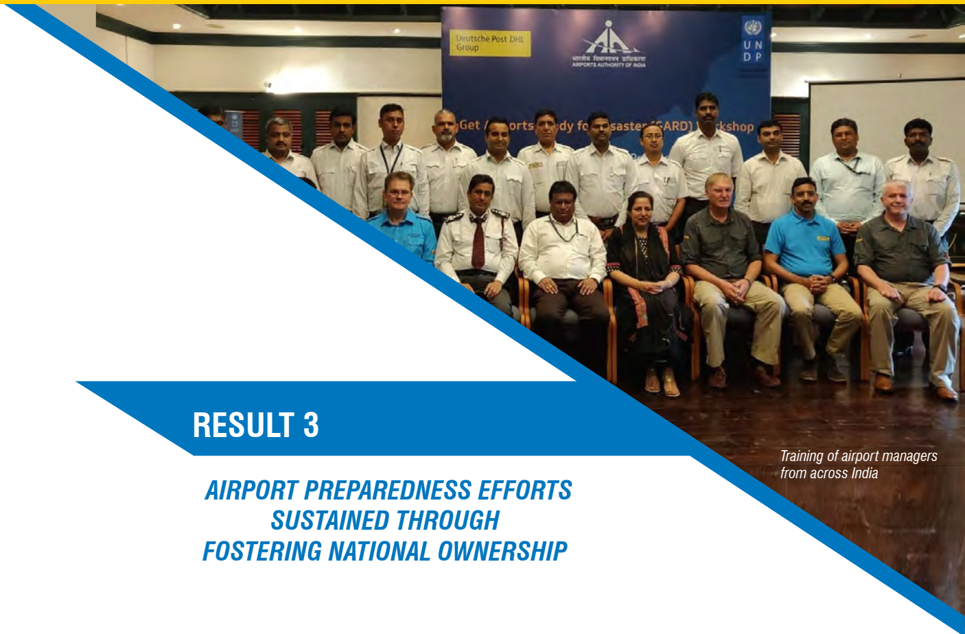
Training of airport managers from across India