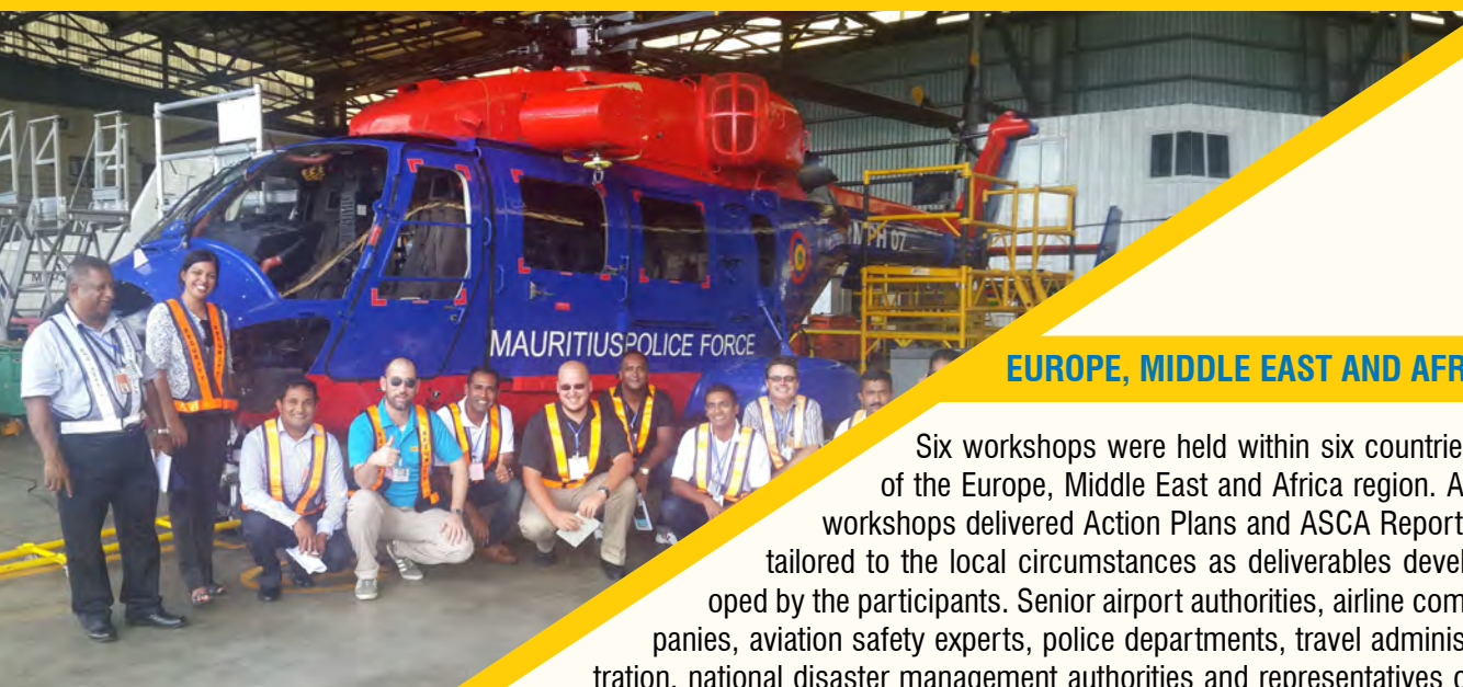
Group picture after evaluating the airport equipment in Mauritius