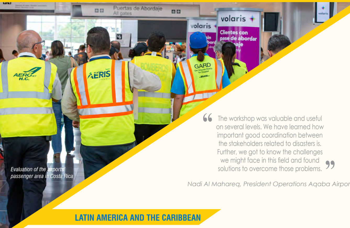
Evaluation of the airports' passenger area in Costa Rica

“ The workshop was valuable and useful on several levels. We have learned how important good coordination between the stakeholders related to disasters is. Further, we got to know the challenges we might face in this field and found solutions to overcome those problems. ”